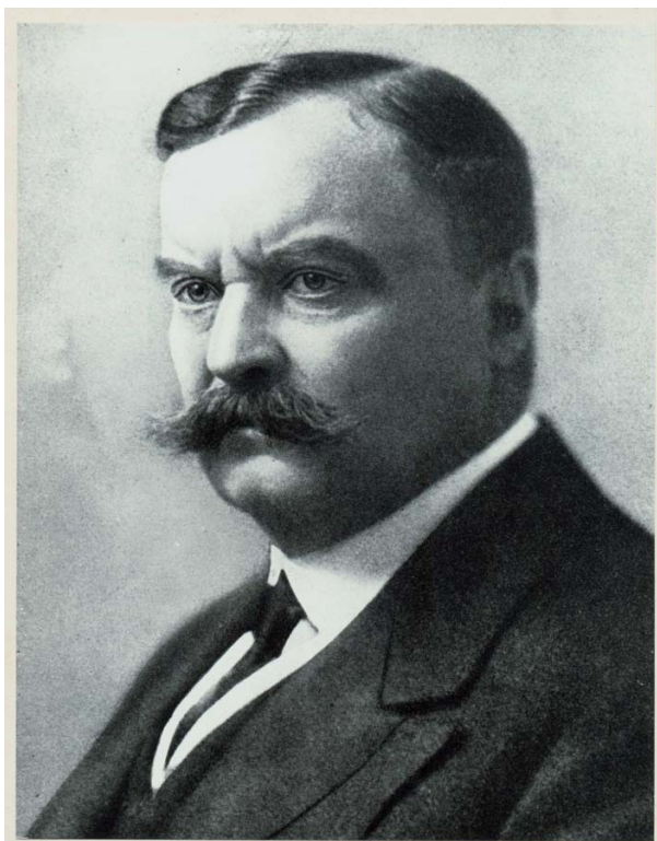
Figure 2 Sir David Bruce (1855–1931). The Scottish bacteriologist identified T. brucei as the aetiological agent of nagana disease.